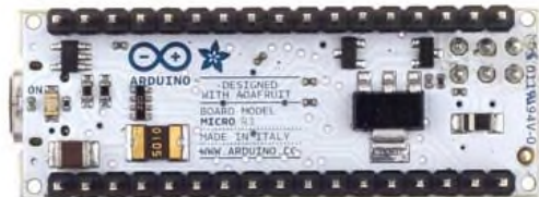
Arduino Micro Rear