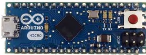
Arduino Micro Front