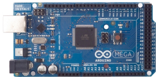
Arduino Mega 2560 Front