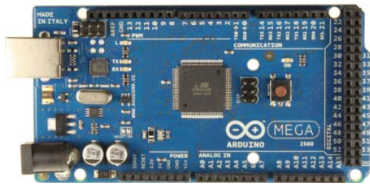
Arduino Mega 2560 R3 Front